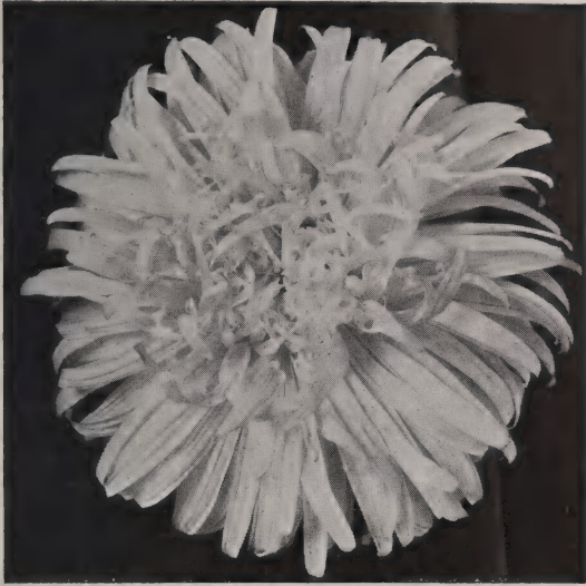
Triumph of the Market